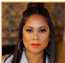
ANGELA YEE Entrepreneur and Radio Host