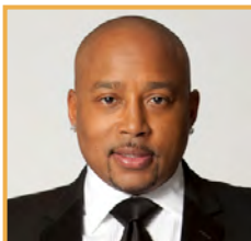
DAYMOND JOHN Founder/CEO of FUBU and Star of ABC's Shark Tank