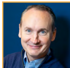
DAVID GARDNER Co-Founder, The Motley Fool