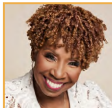
IYANLA VANZANT Renowned Speaker, Author and CEO